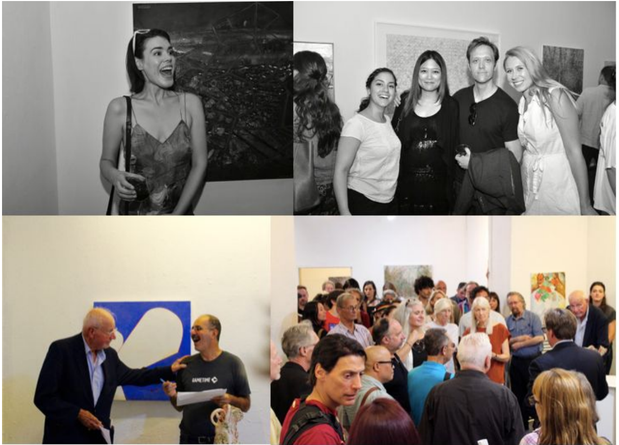
Guests at 2016 Alumni Exhibition Opening Event